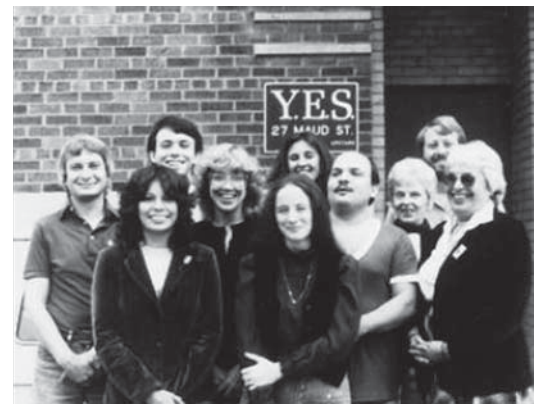
Figure 7: Youth Employment Services (YES) opened its first office in Toronto in 1968.

New counselling services were opened to provide career and employment counselling to youth in Ontario. The first Youth Employment Services (YES) office opened in Toronto in 1968. In the 1980s, this grew to a network of 50 youth employment counselling centres (YECCs) across Ontario, which worked with unemployed youth aged 16 to 24.