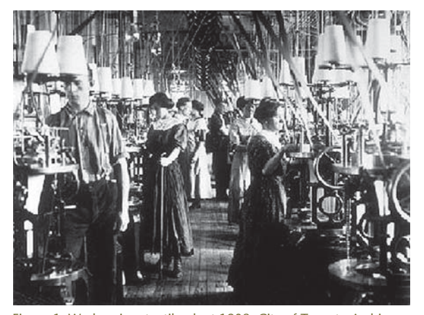
Figure 1: Workers in a textile plant 1908.

The YMCA originated in 1844 in England to help young men in the cities develop a balanced life in body, mind, and spirit through religious and recreational programs. The first YMCA in North America opened in Montréal in 1851, and by 1900 there were 36 associations across Canada. The YMCA was the first to introduce guidance to young people