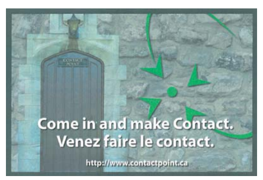
Figure 9: Early postcard to promote the ContactPoint website.