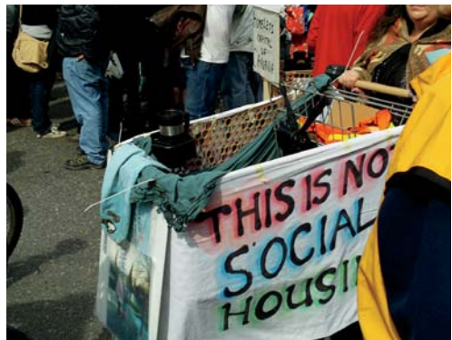
Figure 2: A shopping cart is a common tool for carrying your belongings when you are homeless.

How do Bill and others in his situation survive on welfare and at the same time try to find work? The $610 per month that Bill receives is based on $375 for shelter and $235 for “supports.” Supports consist of everything that everyday life requires — food, tea or coffee, bus tickets, toilet paper, razor blades, toothpaste, a pen, a notebook, all for around $7.73 per day. Bill can't find a room at $375; instead he pays $435 for his room. The extra $60 a month comes out of his $235 support