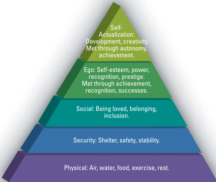
Figure 5: Maslow's Hierarchy of Needs.

feed himself while he's been on welfare, but these services are offered during the day when he will now be working. You will work hard to connect Jay to that chef job he wants and is absolutely qualified to apply for, hoping that he won't still be sleeping in the local park when the colder weather comes, and that he can still get free showers every day so he smells fresh when showing up to cook.