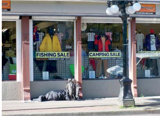
Figure 4: The homeless person's camp is not the sort of camping that's on sale.

When you are providing employment counselling, who are you working for? Is it the government, the unemployed person in front of you, the taxpayers, or your own employer?