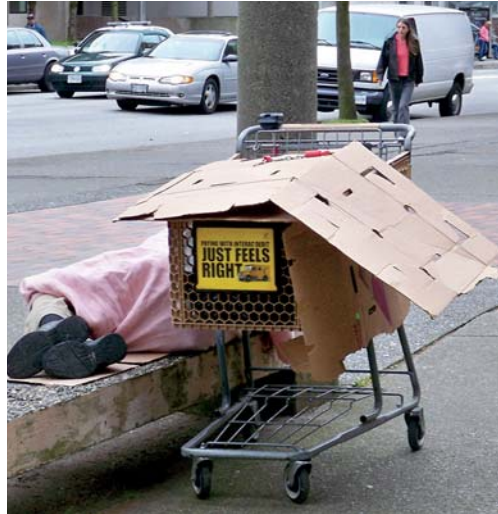
Figure 3: Shopping cart has a plaque with the words, "Paying with Interac Debit Just Feels Right." Clearly, this photo is not what Interac services intended.

The reality is that someone has to appear to apply for jobs they don't want, won't get, or can't find. From an employment counselling perspective, this deeply damaging dance crushes an unemployed person's dignity. Much of my frontline work addresses the effects of the damage inflicted by welfare.