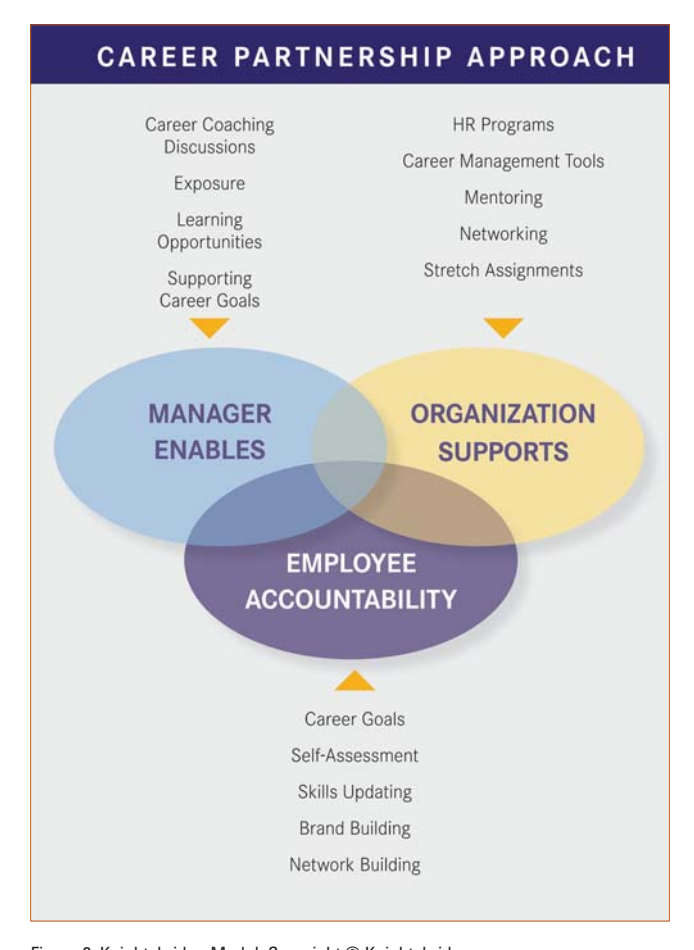
Figure 2: Knightsbridge Model. Copyright {\small \circledR} Knightsbridge.

You are not on your own. When it comes to your career journey, companies do want to help their employees. Companies that invest in career management improve